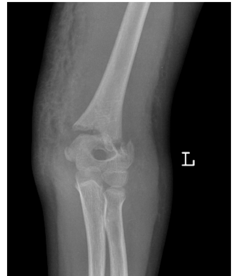
Figure 1 A & B: SCH fracture