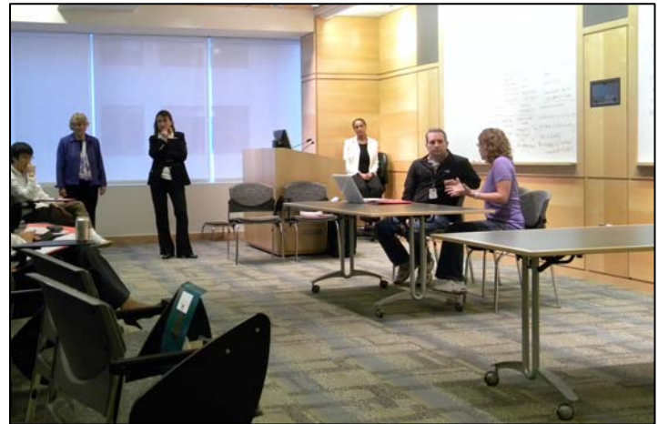
Bok Players' "Trouble in the Lab" Performance, 10/08/09

The MGPA also ran a very successful pair of panel discussions this fall to help research fellows prepare a CV for academic or industry jobs. In addition, the 2009 MGPA officers have instituted a volunteer effort, allowing MGH postdocs the chance to give back to the community. They have helped to harvest food at a farm devoted to feeding hungry Boston families, and in December they helped purchase and serve a holiday meal to homeless families. We are very proud of the work being done by our postdoctoral fellows.