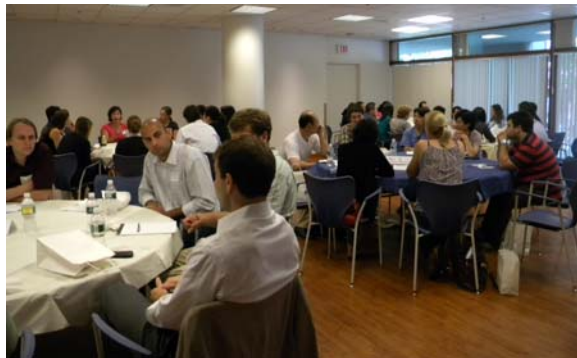
Participants at the MGPA's September 1, 2010 Mentored Lunch focusing on "Careers Away from the Bench."

Networking event at the Charlestown Navy Yard on September 24 th . In honor of Postdoc Appreciation Day, this event will bring postdocs together for a casual outdoor meal to have fun, meet people from other labs, and learn more about the Postdoc Association. On September 29 th the MGPA will host an important event for all postdocs who want to take part in the new Industry Exploration Program . The seminar will discuss Intellectual Property guidelines for the program, and will give information on applying to the program. Go to www.massgeneral.org/mgpa for more information.