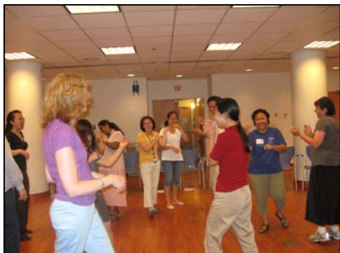
Laughter Yoga for Researchers, July 31, 2009

In addition to these programs, we offered a intensive full day session for non-native English speaking faculty and research fellows, Accent Modification: Striving for Communication Excellence . In this program, participants were taught ten tips for effective communication that can be used in everyday conversations at work and on the phone. The focus in the afternoon was on effective public speaking skills, with participants learning about breath support, rate of speech, body language and nervousness.