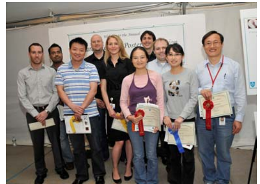
2009 Poster Celebration winners.